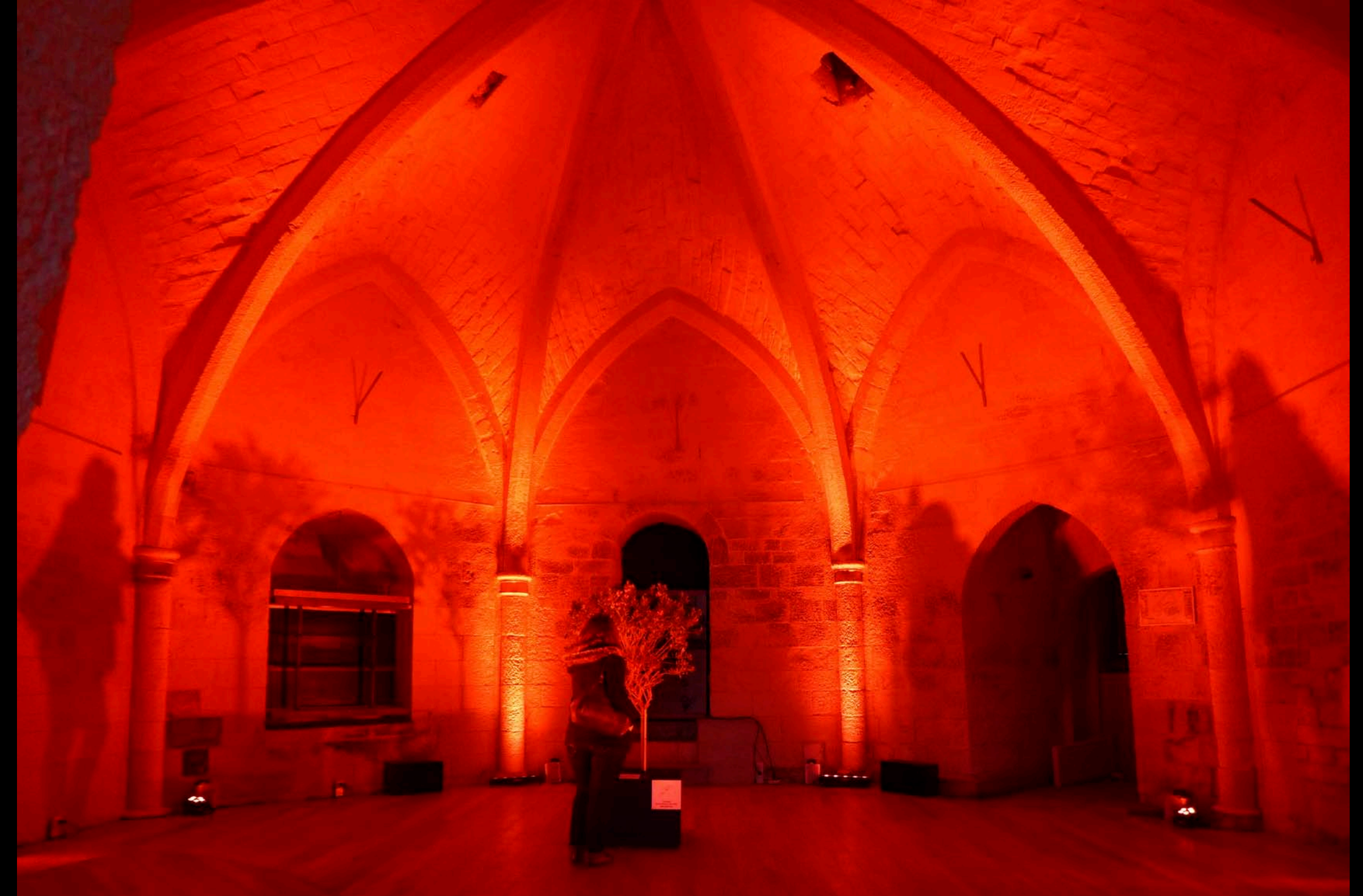
Tour de La-Rochelle / Festival Zéro 1 - La-Rochelle (Fr)