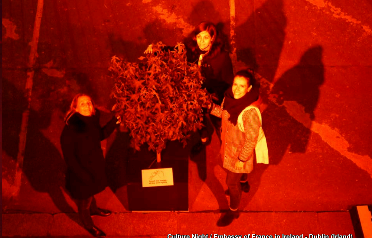
Culture Night / Embassy of France in Ireland - Dublin (Ireland)