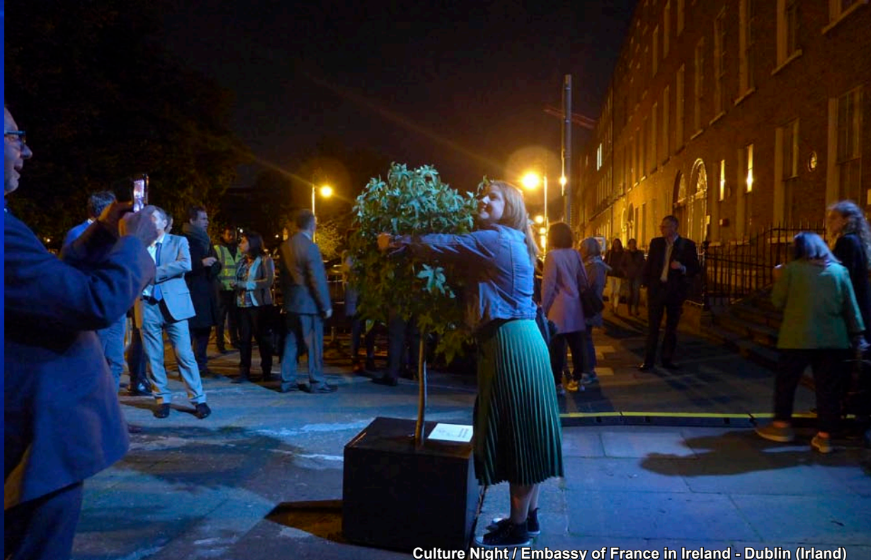
Culture Night / Embassy of France in Ireland - Dublin (Ireland)