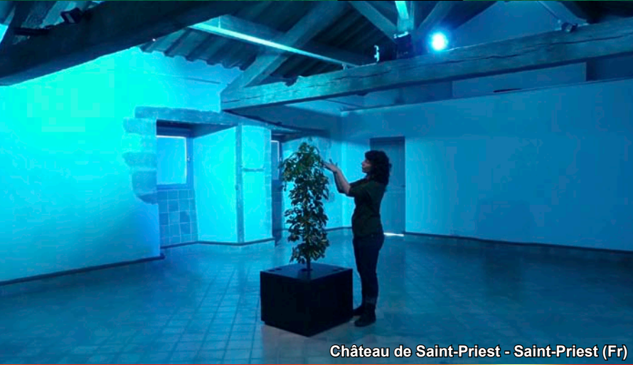
Château de Saint-Priest - Saint-Priest (Fr)