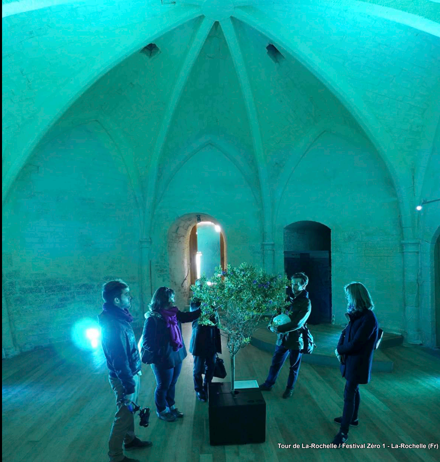
Tour de La-Rochelle / Festival Zéro 1 - La-Rochelle (Fr)