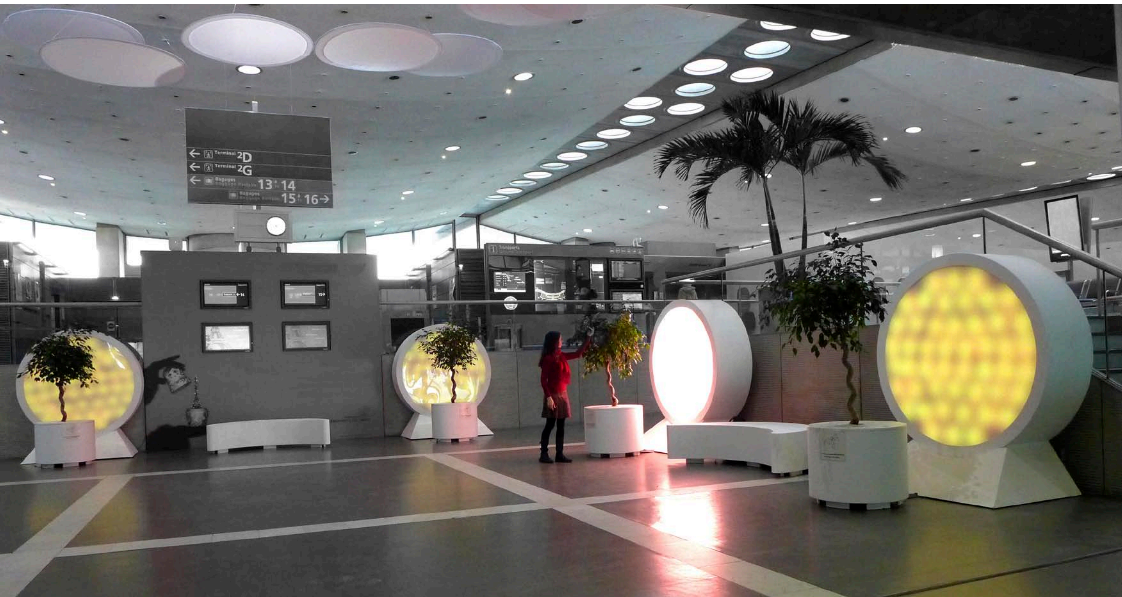
Lumifolia / Airport Roissy Charles de Gaulle / Commande publique / Digitalarti / Aéroports De Paris (Fr)